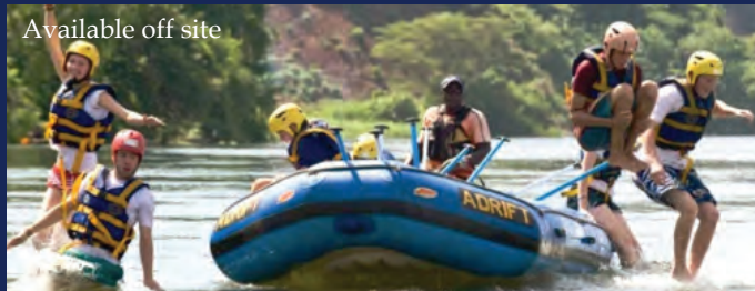
Available off site

Straight from New Zealand, home of Bungee. Operated with the highest Australasian safety standards. Height is 44m/145ft. Water Touch is available.