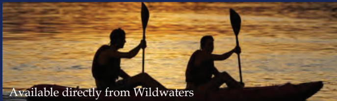
Available directly from Wildwaters

Enjoy some light fishing in the rapids that surround the island. A very relaxed affair that sometimes brings in some great sized surprises.