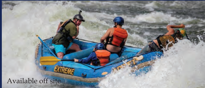
Available off site

Enjoy a delicious buffet lunch whilst cruising around the first few kilometers of the Nile. Simply sit back, relax and enjoy the African sun. The team on board will keep the food flowing which consists of a selection of dips, starters, cold meats and an array of salads and desserts. The trip operates from 1230 - 1430. Cash bar available