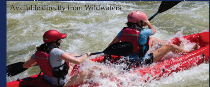
Available directly from Wildwaters

All Terrain Adventures provide 1 - 3 hr rides, 7 days a week offering ride-yourself, guided safaris 'off the beaten tracks and into the warm heart of Uganda', taking you to places that many visitors never get to see