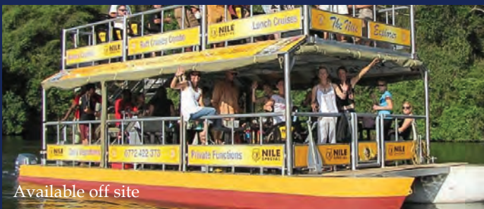
Available off site

Take a relaxing Kayak Sundowner Cruise or use a Stand up Paddle Board amongst the jungle and tropical islands on a flat water section of the famous White Nile. This slow paced activity is suitable for a variety of ages and no prior paddling experience is needed. Our guide will entertain you with local stories and share his knowledge of the wildlife found in this paradise. Sundowner drinks included.