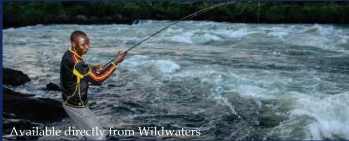
Available directly from Wildwaters