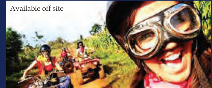
Available off site

Short safaris range from 1 - 3hrs rides and are available 7 days a week starting from 10am and 2pm. Bookings are essential. Enjoy a leisurely ride through villages and farm land along the River Nile on great horses.