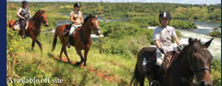
Available off site

For those that don't have a lot of time but want to fit in as much as possible, this is a great value for money combo. Pick up from WWL and enjoy a bungee jump first followed by a day of rafting including lunch with drop off back at WWL.